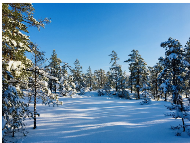
"Winter in Finland"